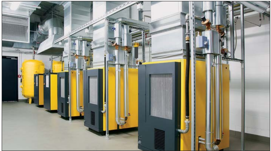
Air-cooled compressors with a combination of exhaust air and fluid circuit heat recovery.

Compressing air converts much of the electrical energy you buy into heat. Whether air or water-cooled, Kaeser compressors can be easily adapted for heat recovery to achieve even greater energy savings.